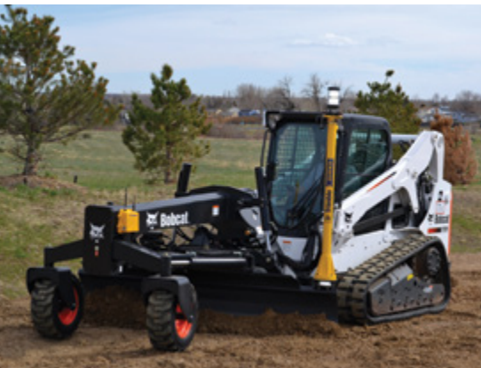
Bobcat with HD Grader Attachment and Trimble GCS900 Grade Control System with Universal Total Station