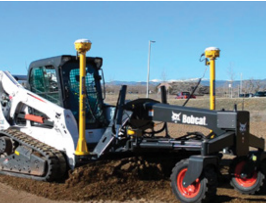
Bobcat with HD Grader Attachment and Trimble GCS900 Grade Control System with Dual GNSS