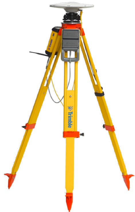
GNSS Base Station