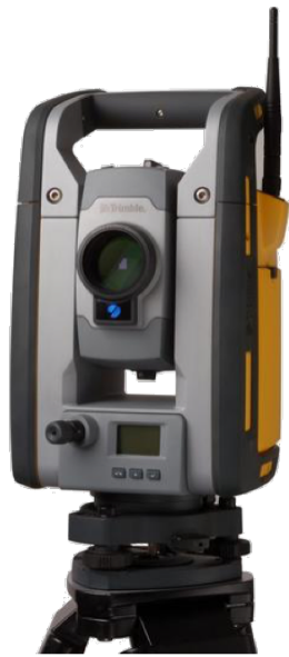
Universal Total Station